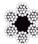
6 X 19 (12/6/1) FIBRE, PVC OR PP CORE

Safe Working Load (SWL) Divide Strength by 5 ie: 2.5mm 1 x 19 500kg divided 5 = 100 kg