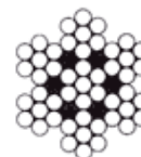
7 X 7 (6/1) WIRE STRAND CORE